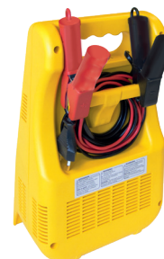
Cables and clamps stowage within the unit.